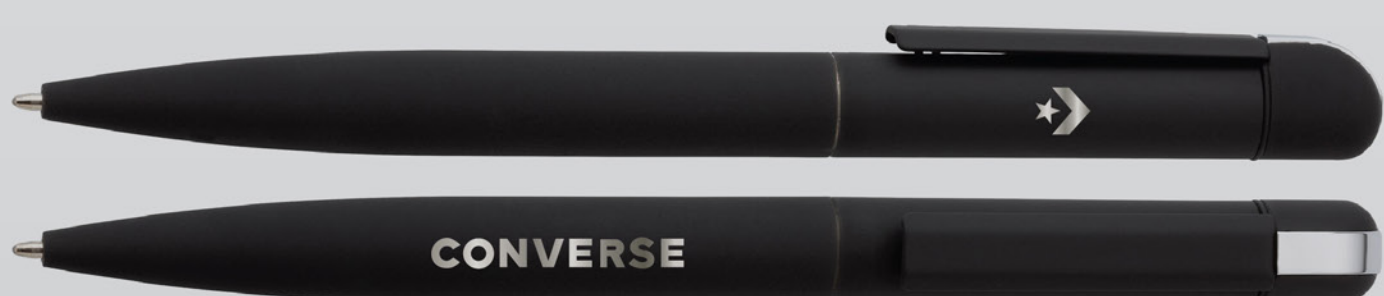
ROMILDA BALLPOINT PEN - G3113