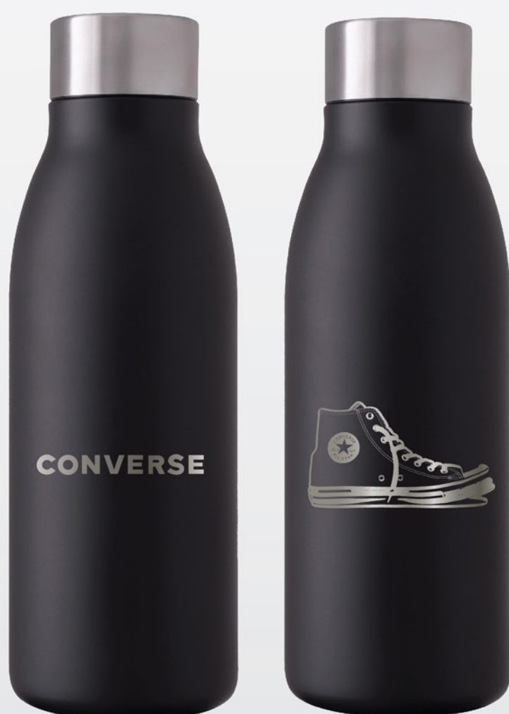
TOP NOTCH REFLECTION 600 ML / 20 OZ STAINLESS STEEL BOTTLE - DW306